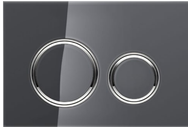
↑ Sigma10 Lava Glass

→ MODERN BATHROOM DESIGN HAS BEEN INCREASINGLY FOCUSED ON ADDING COLOUR ELEMENTS TO ACHIEVE THE PREFERRED ATMOSPHERE.