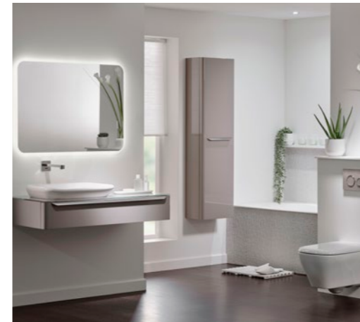
↑ Complimentary material choice

Colour shade variance comes from the different materials used in production. This poses challenges when matching metal and/or plastic accessories with ceramic fixtures.