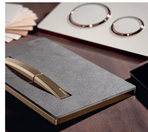
↑ Use consistent finishes across the bathroom

The choice of bathroom finishes can also impact colour consistency across the bathroom. Tapware, shower handles, and other bathroom hardware are available in a variety of finishes, including chrome, brushed nickel, oil-rubbed bronze and stainless steel. A common approach is to choose fixtures and accessories in matching materials and finishes. While it is relatively easy to find matching accessories for popular finishes such as chrome, this is not the case for every finish type. Designers may also want the freedom to support multiple finishes in one space.