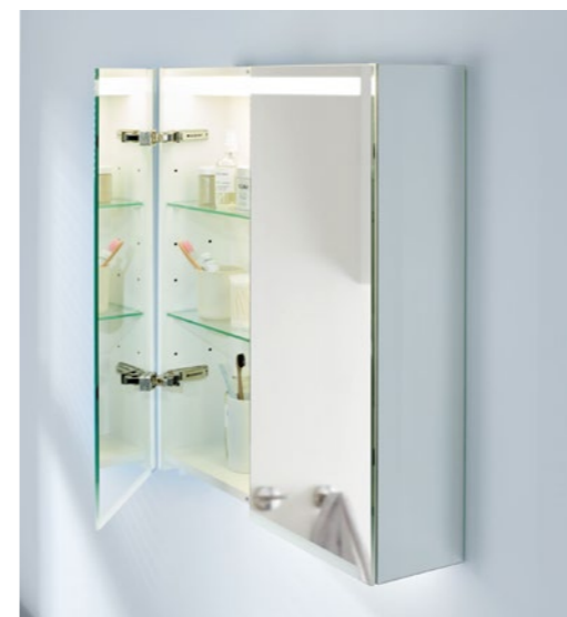
↑ Natural and artificial light has an impact on design

The way the human eye perceives the colour of objects can depend on lighting. Accordingly, the colours of objects will not look the same throughout the day. In spaces exposed to plentiful sunlight, as the amount and angle of the sun changes, so will the colours in the bathroom. Where there is artificial light, the type of light bulb can alter the colours in a room.