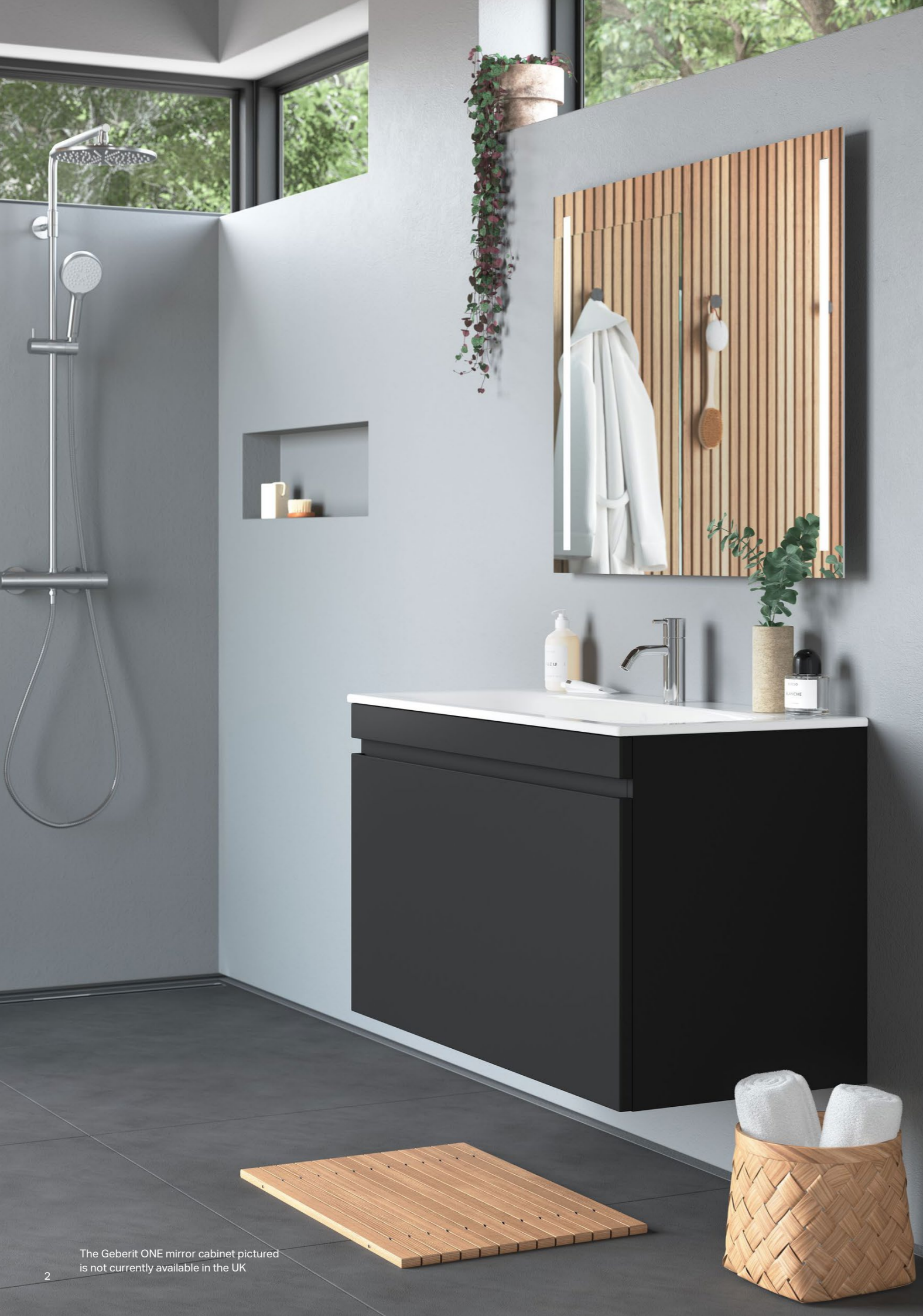
The Geberit ONE mirror cabinet pictured is not currently available in the UK

Colour has a profound influence on a space and the people who use it. Colour transmits sensations and emotion – it is an international visual language that enables architects and designers to communicate a concept or set a mood through interior design. Selecting a colour scheme for a room can dramatically affect how the interior space is perceived and the atmosphere it delivers. The bathroom is no exception.