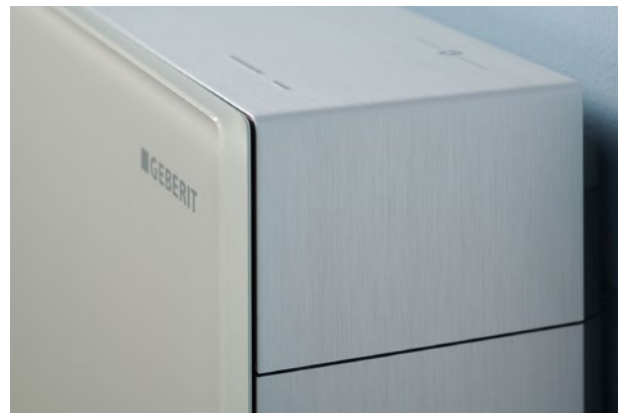
↑ Geberit Monolith Sanitary Plus Module

The less materials and colours used in a space, the greater the overall impression of colour consistency and sense of calm. Inconsistency between accessories and fixtures may compromise the overall impression of harmony and cohesion.